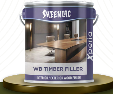
WB TIMBER FILLER