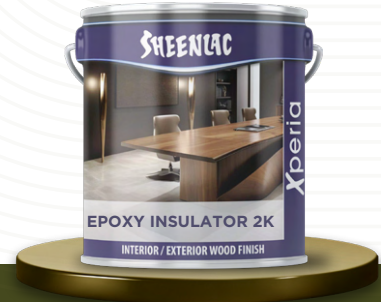
EPOXY INSULATOR 2K