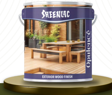
OPULENCE EXTERIOR 2K PU