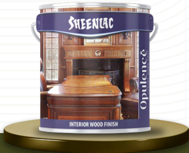
OPULENCE INTERIOR 2K PU