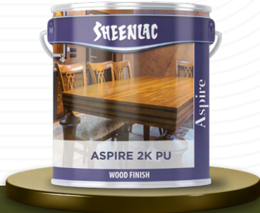
ASPIRE 2K PU