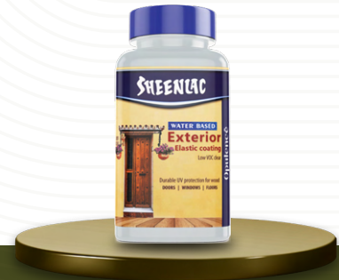
WB EXTERIOR ELASTIC COATING