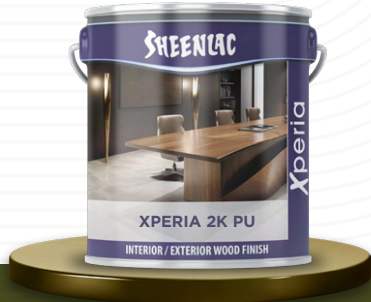
XPERIA 2K PU

Xperia SERIES PREMIUM PAINTS & WOOD COATINGS