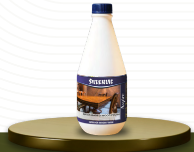
WB 1K WOOD POLISH